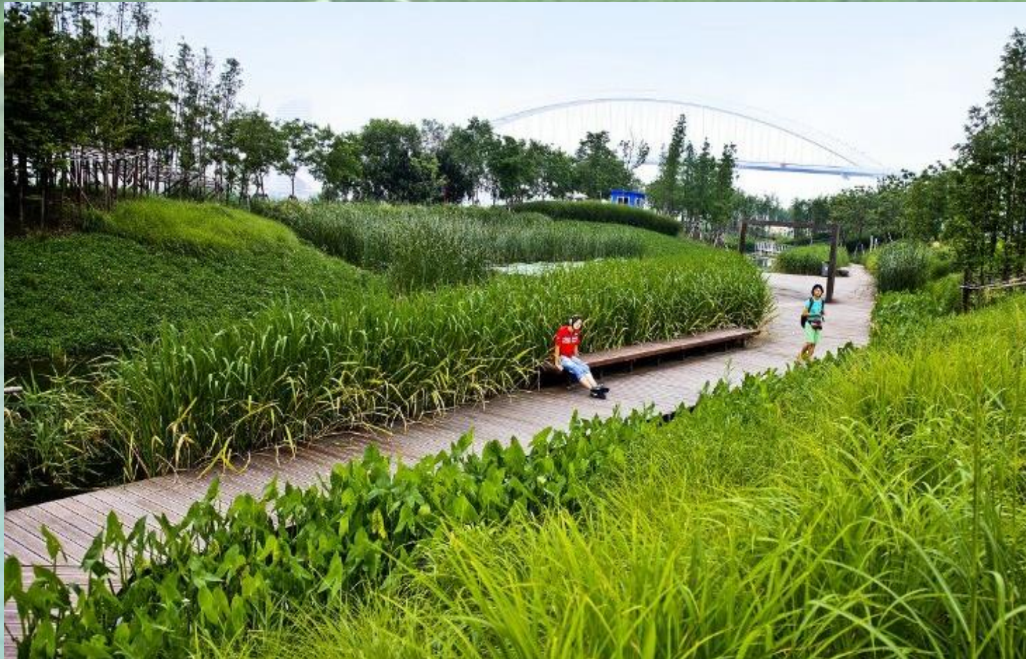
BOARDWALK ALONG WETLAND