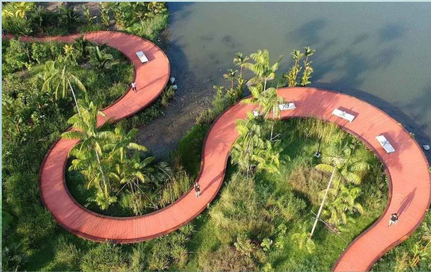
REED PLANTATION ALONG EDGES TO FILTER