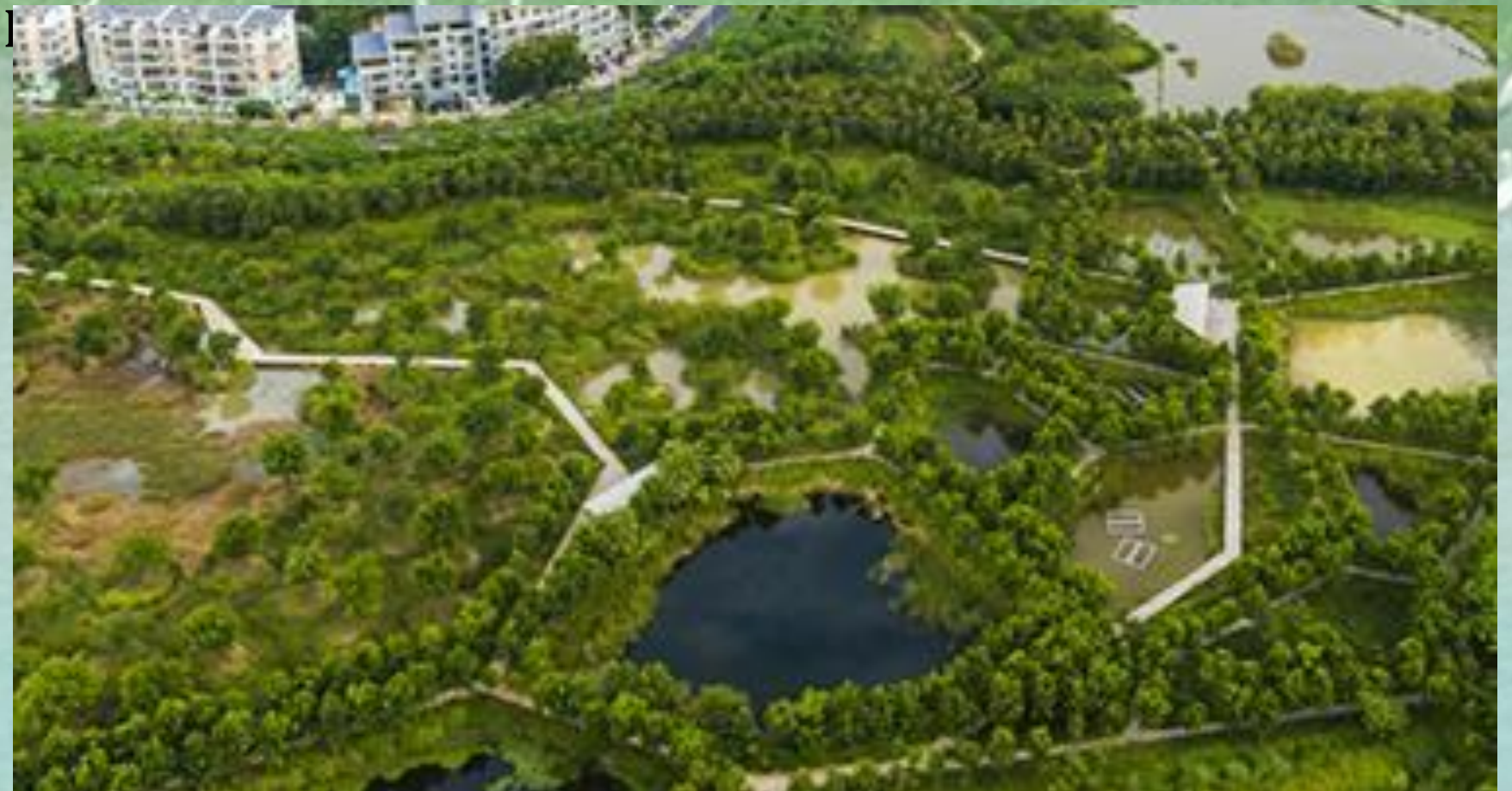
FOSTERING THE CONCEPT OF RESILIENT SPONGE CITY