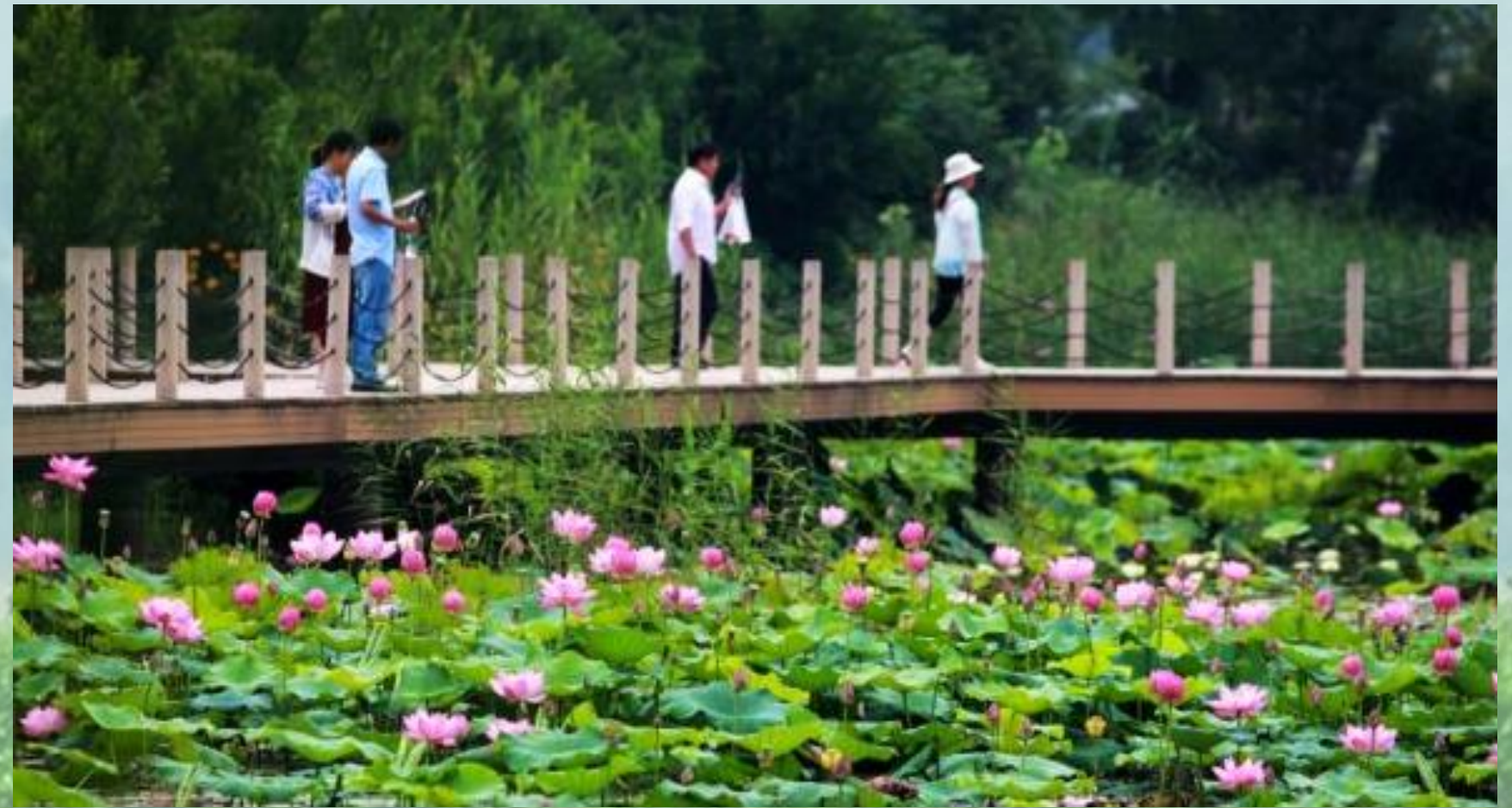
BOARDWALK ALONG LOTUS